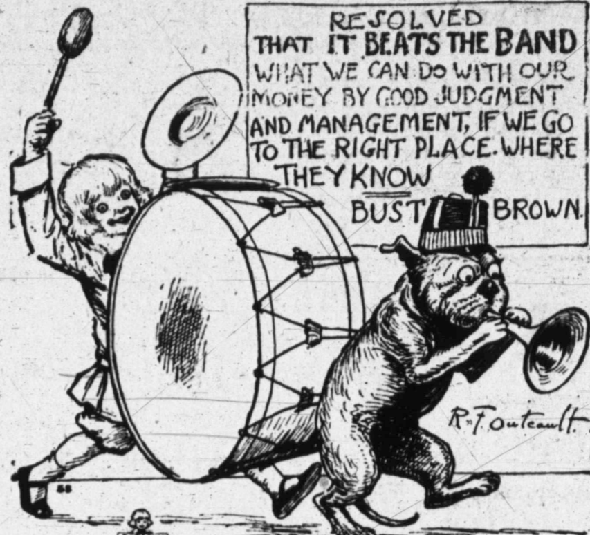
Copyright 1906 by the Buster Brown Co. Chicago.