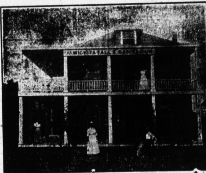
THE WICHITA FALLS SANITARIUM