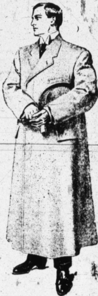
Copyright 1907 The House of Kuppenheimer Chicago