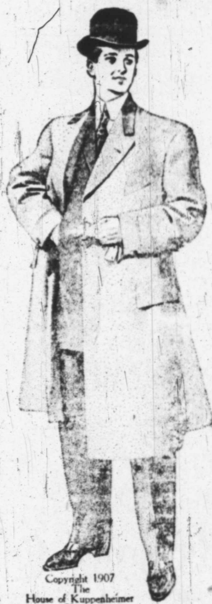
Copyright 1907 The House of Kuppenheimer Chicago

The P. H. PENNINGTON CO. will consolidate their Dalhart store with the store here, and all hands are busy at Dalhart packing up the goods to be here about January 1st. We want to clean out every remnant, every odd piece of goods in our house. Every man's suit and overcoat, ladies' coats, suits and skirts are included in the special cut prices which we are making.