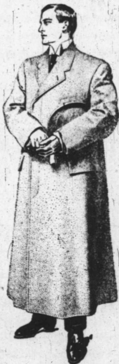
Copyright 1907 The House of Kuppenheimer Chicago