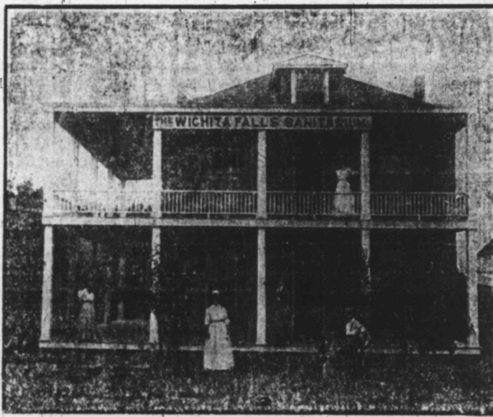
THE WICHITA FALLS SANITARIUM A modern, up-to-date institution for treatment of Medical and Surgical Diseases. Trained nurses in attendance. Corner 7th St. and Scott Ave.

Rates of Postage on Post Cards and Postal Cards Mailed Under Cover of Envelopes. October 3, 1907. Post cards and postal cards mailed under cover of sealed envelopes (transparent or otherwise) are chargeable with postage at the first-class rate—two cents an ounce or fraction thereof. If inclosed in unsealed envelopes, they are subject to postage according to the character of the message—at the first class rate if wholly or partly in writing, or the third class rate (one cent for each two ounces or fraction thereof) if entirely in print, and the postage should be affixed to the envelopes covering the same. Postage stamps affixed to such cards inclosed in envelopes having an opening exposing the stamps cannot be recognized in payment of postage thereon. However, where such cards, properly addressed and prepaid—bearing no matter rendering them unmailable under Postmaster General's Orders Nos. 146 (par. 5) and 539 (par. 4) when sent openly in the mails—are inclosed in envelopes, it will be assumed that they were inadvertently placed under cover and they may be removed therefrom and dispatched without additional payment of postage. 5. Cards bearing particles of glass, metal, mica, sand, tinsel or other similar substances are unmailable except when enclosed in envelopes.