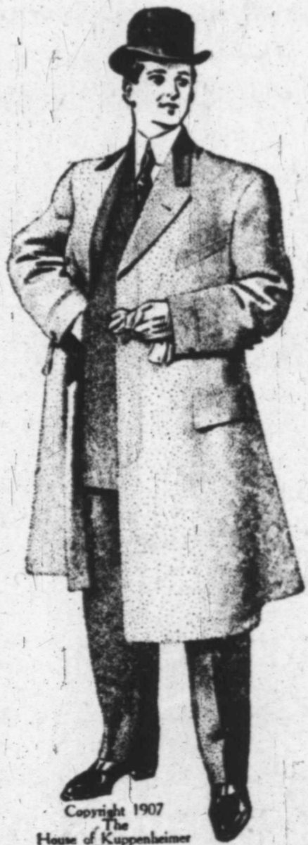
Copyright 1907 The House of Kuppenheimer Chicago