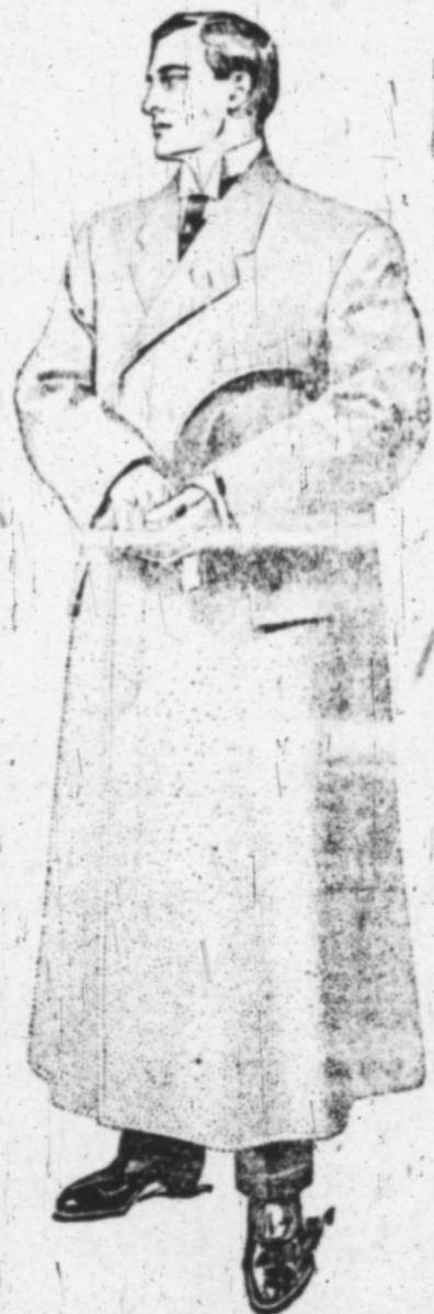
Copyright 1907 The House of Kuppenheimer Chicago