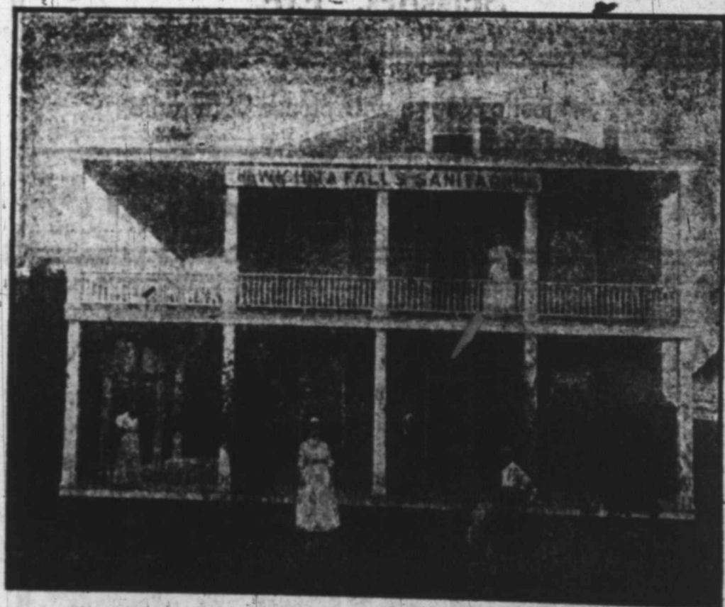
THE WICHITA FALLS SANITARIUM A modern, up-to-date institution for treatment of Medical and Surgical Diseases. Trained nurses in attendance. Corner 7th St. and Scott Ave.

Dealer in FIREARMS, SPORTING GOODS, BICYCLES AND SEWING MACHINE SUPPLIES—FINE POCKET CUTLERY. General Repairing a Specialty Agents RACYLE, best Bicycle made Indiana Ave. Wichita Falls, Tex.