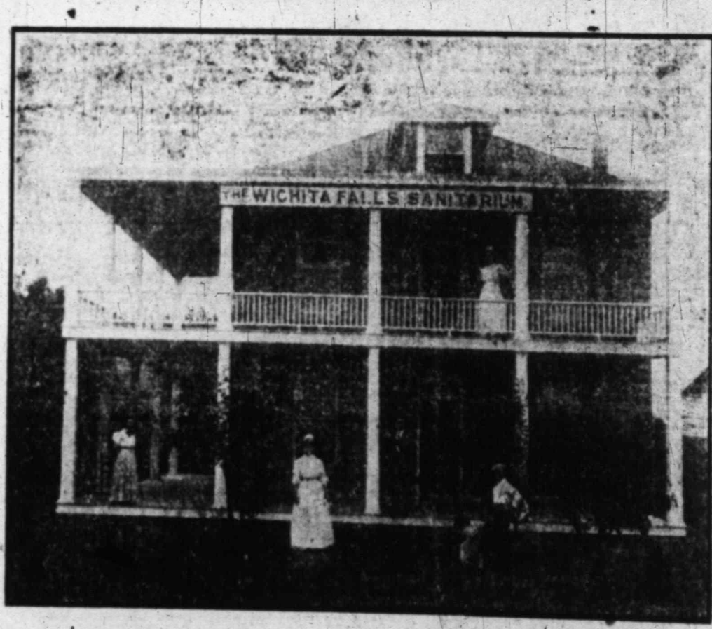
THE WICHITA FALLS SANITARIUM Amodern, up-to-date institution for treatment of Medical and Surgical Diseases. Trained nurses in attendance.

When a woman asks her husband 176-tf prised if she gets it in the neck.