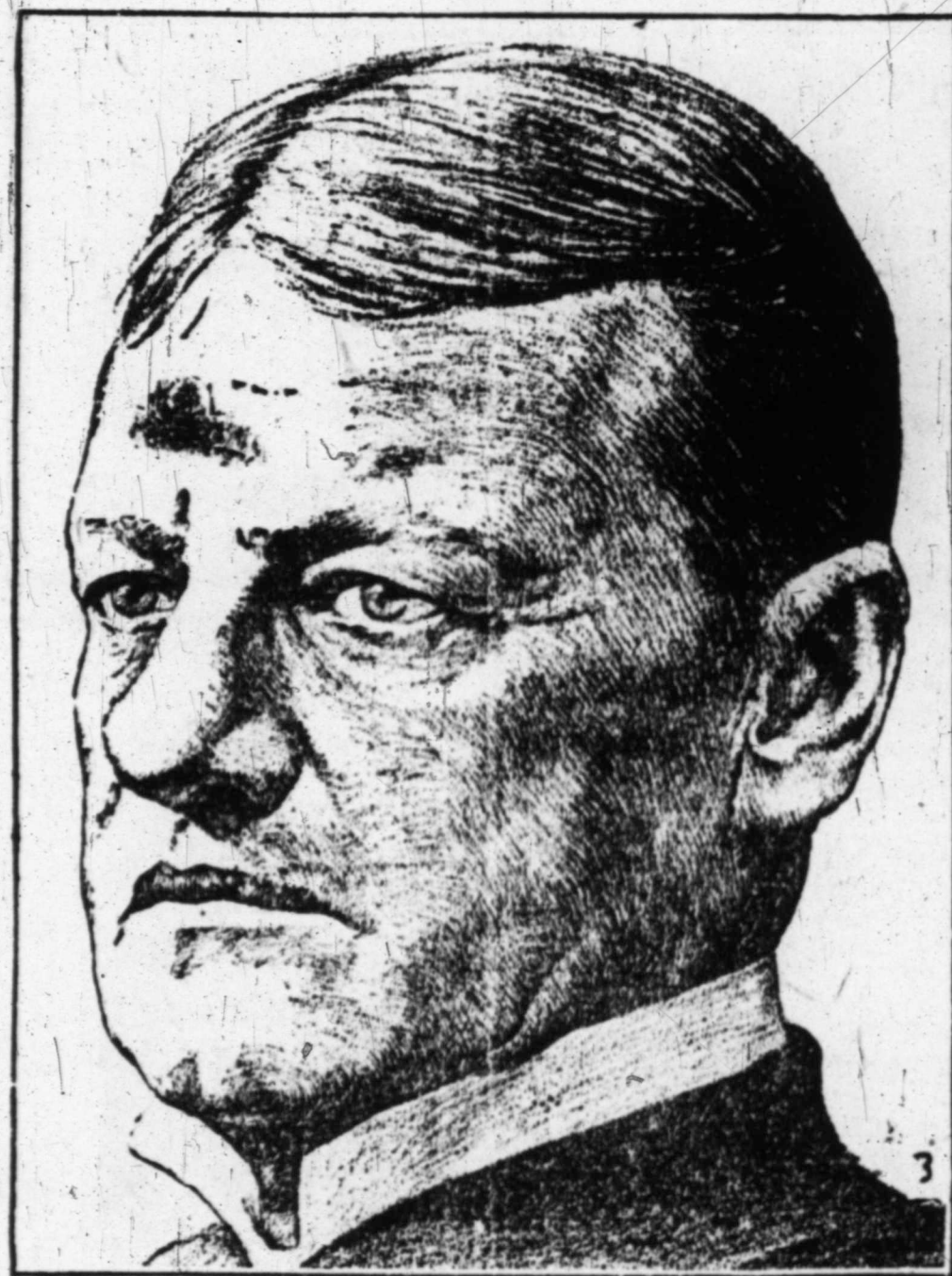
REAR ADMIRAL ROBLEY D. EVANS.