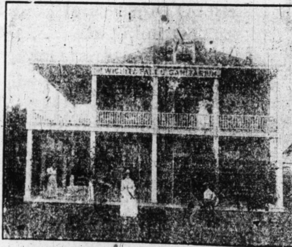
THE WICHITA FALLS SANITARIUM A modern, up-to-date institution for treatment of Medical and Surgical Diseases. Trained nurses in attendance. Corner 7th St. and Scott Ave.