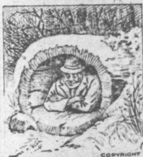
A HOLLOW LOG IN A SNOW STORM

may not be the worst shelter Thanksgiving Day, Christmas Day or any other winter day, but vastly superior and in every respect more satisfactory, are the numerous houses we offer on such easy terms as to enable any man of moderate means to purchase one. Can't buy? Well, we'll rent you one.