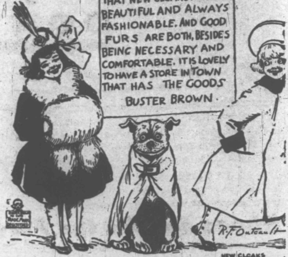
1897 COPYRIGHT 1906 BY THE DUNBAR BROS. CO. CHICAGO. NEW CLOAKS

RESOLVED THAT NEW CLOAKS ARE ALWAYS BEAUTIFUL AND ALWAYS FASHIONABLE. AND GOOD FURS ARE BOTH, BESIDES BEING NECESSARY AND COMFORTABLE. IT IS LOVELY TO HAVE A STORE IN TOWN THAT HAS THE GOODS BUSTER BROWN.