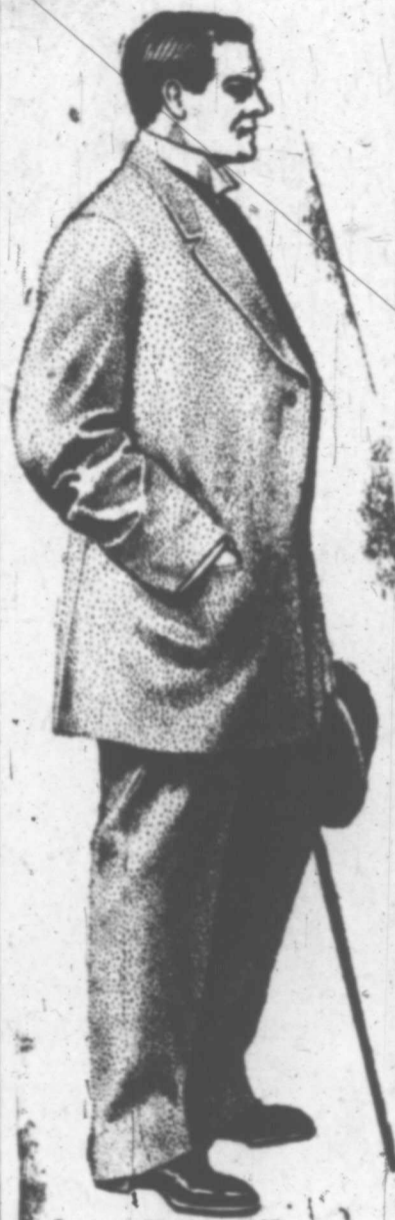
Copyright 1907 The House of Kuppenheimer Chicago