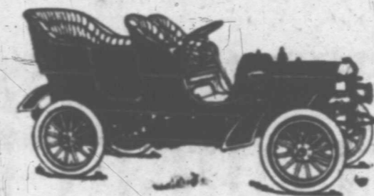
We are sole agents for the Buick Machines