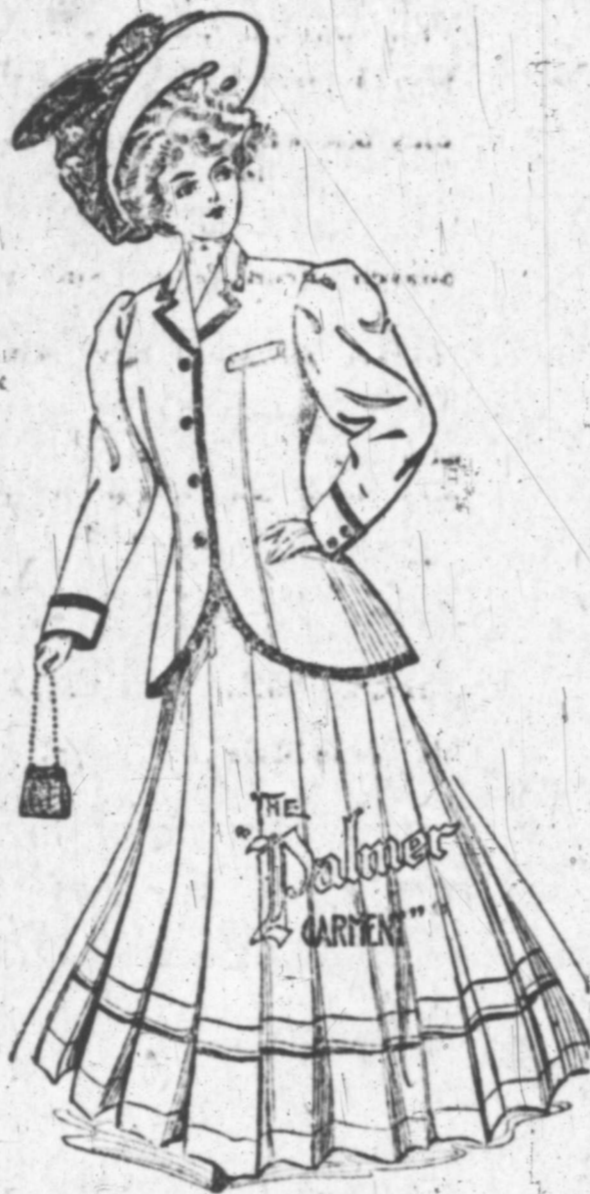
Ladies' Suits Made to Measure.

In every conceivable style and shape. A handsome line of the new imported belts in the elastic, trimmed in cut steel, beaded and velvet a. 1.25 to $5 00