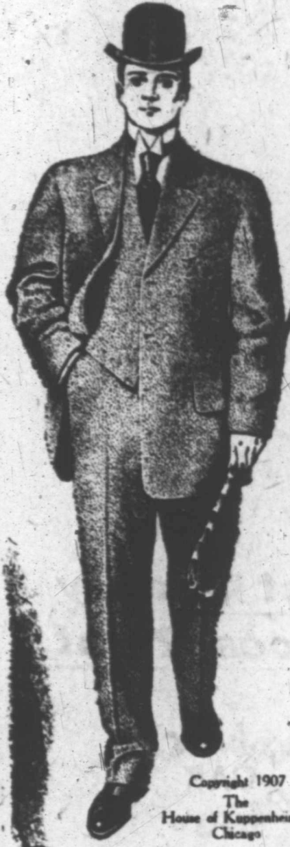
Copyright 1907 The House of Kuppenheimer Chicago

We are the busiest lot of clerks you nearly ever saw, but we are not too busy to show you through our NEW GOODS whether you want to buy or not. You will always find a hearty welcome at this store.