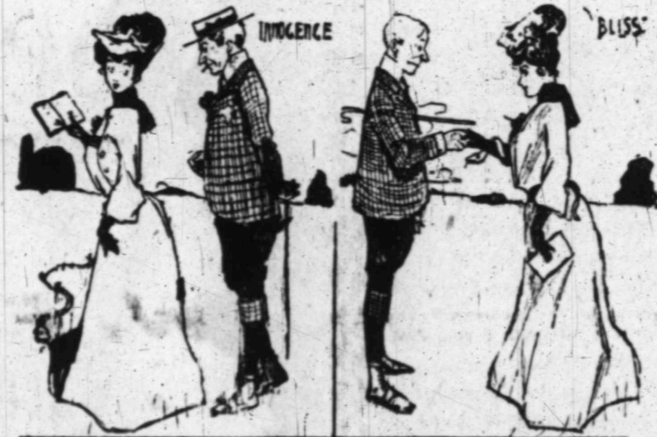
ADAM, EVE AND THE SERPENT.