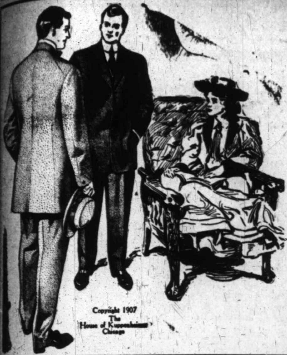
Copyright 1907 The House of Kuppenheimer Chicago