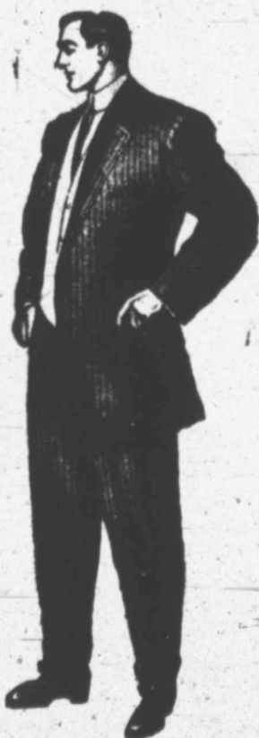
Copyright 1909 The House of Kuppenheimer Chicago

is everything to a woman and she dotes on it continually. Men are, each year, more particular about their clothes appearance, for they are fast learning that Stylish Clothes cost no more than the other kind. Kuppenheimer Clothes for Men and Young Men have unmatched grace and smartness that fascinates at the first glance. The excellent materials, soft colors, attractive patterns, the unmistakable style and perfect fit of Kuppenheimer clothes for Spring make the most desirable garments. Priced about the same as other clothes but infinitely better in every important feature.