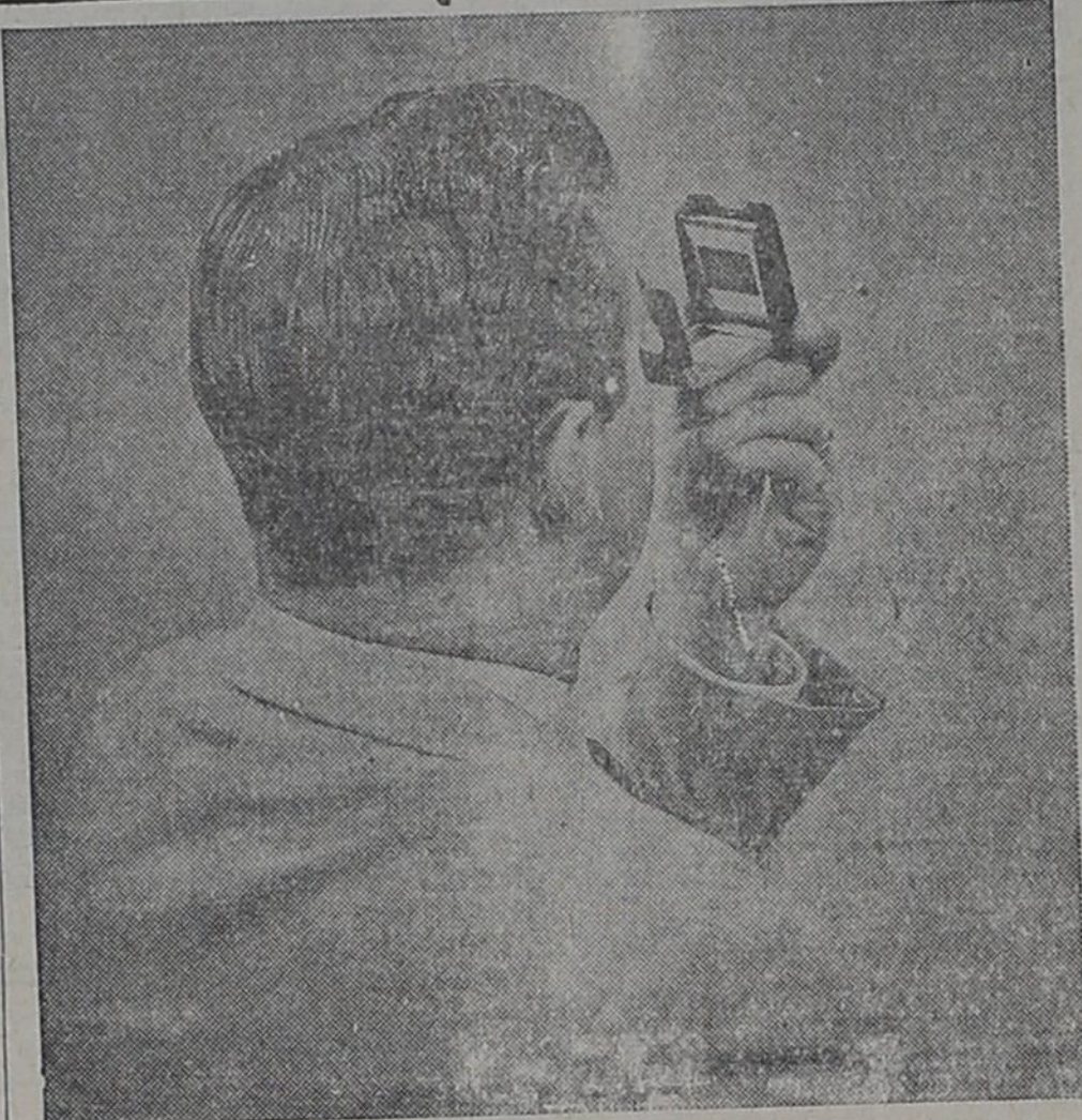
A pocket viewer enables you to enjoy your color slides—any time, any place.