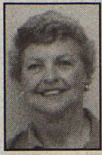
Goodies From G.G.

Pre-heat oven and bake pie shell 8-10 minutes. Set aside. Put the milk in a saucepan, sprinkle the gelatin over it and let it soften for about 3 minutes, stir in the sugar, salt and egg yolks; beat thoroughly, cook stirring, over moderate heat until thickened, do not boil. Add the rum, mix well, chill just until the mixture mounds when dropped from