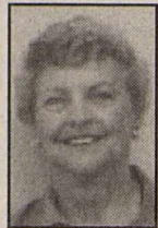
Goodies From G.G.

Preheat oven to 375 degrees. Separate each biscuit into 2 sections. Mix 1/4 cup sugar and cinnamon together. Dip one side of each biscuit into butter and sugar mixture. Arrange 9 biscuit halves on a greased baking sheet