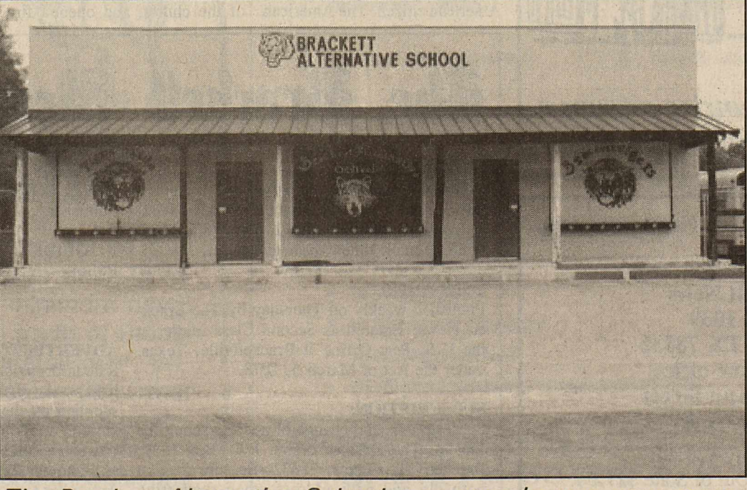
The Brackett Alternative School may soon have a new name.