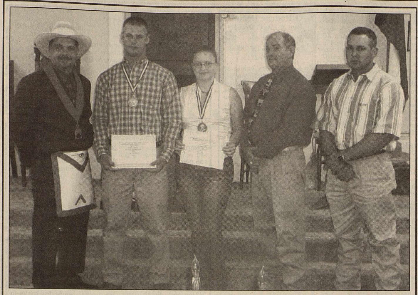
Lamar Medal recipients