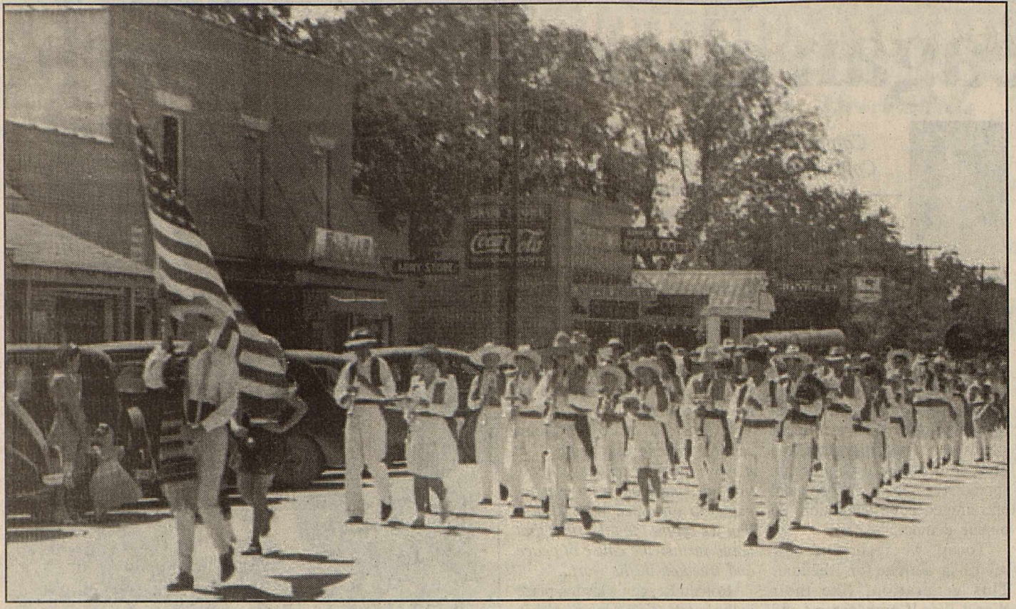
Parade on Spring Street, circa. 1940s