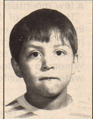
Happy 30th Birthday

If you need emergency help or days?" Base your Family from Fire Department, Law Enforcement or EMS, call 911! (Kin-