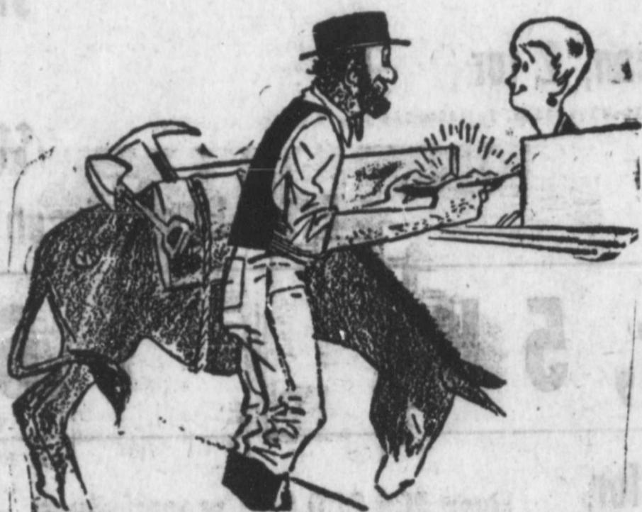
Folks come from all over to save at the

Published every Friday at Hedley, Texas. Entered as second class matter October 23, 1978, at the post office at Hedley, Texas under the Act of August 6, 1954. Acceptance for mailing at special rate of postage provided for in Section 1103, Act of October 3, 1917, authorized on October 23, 1978. Postmaster: Please send address changes in excess of the amount contained in this notice to the attention of the publisher. Changes of address, corrections of respect, change of terms, advertising rates or special functions, when advertiser charged, will be made by advertiser and charged for accordingly. This publication is published weekly upon the character, standing or reputation of any person, firm or corporation which may appear in the columns of this Informer will gladly be corrected upon its being brought to the attention of the publisher.