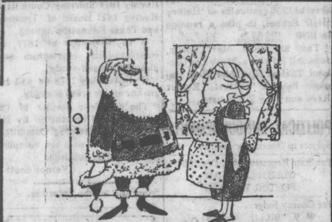
"The sled broke down again this year... it's a good thing I had those traveler's checks from

$3.00 per year in Donley County, $4.00 elsewhere Published every Friday at Hedley, Texas Entered as second class matter October 28, 1910, at the post office at Hedley, Texas under the Act of March 3, 1879. By sale of copy in legal or other advertising the publisher does not become liable for damages in excess of the amount received for such advertising. All obituaries, resolutions of respect, cards of thanks, advertis- ing of church or society functions, when admission charged, will be charged as advertising and charged for accordingly. No un- any erroneous reflection upon the character, stand- ing or reputation of any person, firm or corporation which may appear in the columns of The Informer will gladly be corrected upon its being brought to the attention of the publisher.