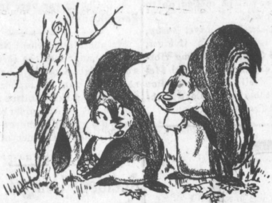
"Nuts! I store my valuables in a safe deposit box at the

Published every Friday at Hedley, Texas Entered as second class matter October 28, 1910, at the post office at Hedley, Texas under the Act of March 3, 1879. It is paid at special rate in legal as other advertising the publisher does not accept liability for damages in excess of the amount received for the advertising. Resolutions of respect, cards of thanks, advertise- ments of society functions, when admission charged, will be accepted as advertising and charged for accordingly. Any erroneous reflection upon the character, stand- ing or reputation of any person, firm or corporation which may appear in the columns of The Informer will gladly be corrected upon being brought to the attention of the publisher.