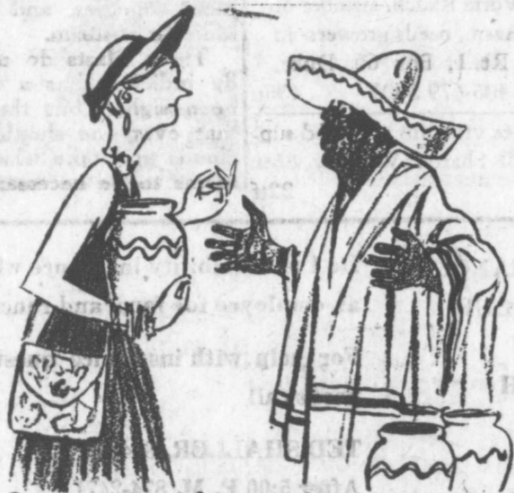
"Si, Senora, we take travelers checks from the

Any erroneous reflection upon the character, standing or reputation of any person, firm or corporation which may appear in the columns of The Informer will gladly be corrected upon its being brought to the attention of the publisher.