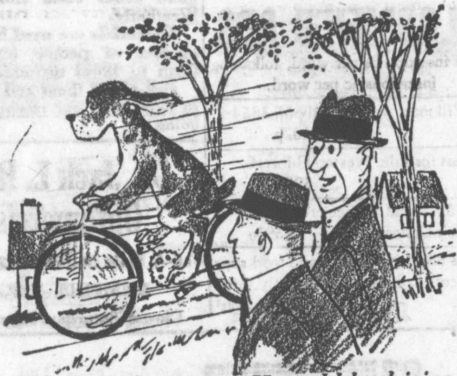
"Oh, he's not so smart. He could be driving his own car with a loan from

Any erroneous reflection upon the character, standing or reputation of any person, firm or corporation which may appear in the columns of The Informer will gladly be corrected upon its being brought to the attention of the publisher.