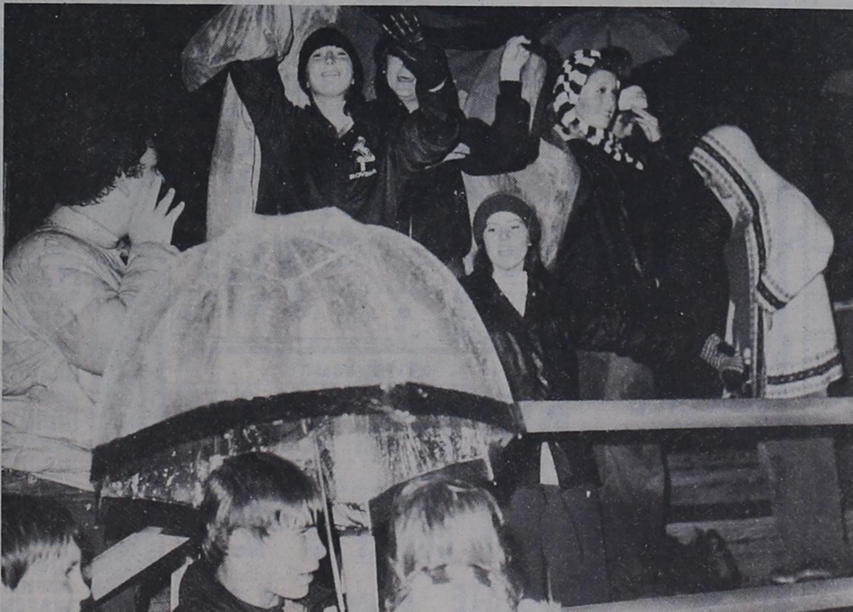
WET AND HAPPY?...You may ask how these people can be wet and cold and still be happy. That's

because they are watching the Bovina Mustangs beat the Springlake-Earth Wolverines 26-0.