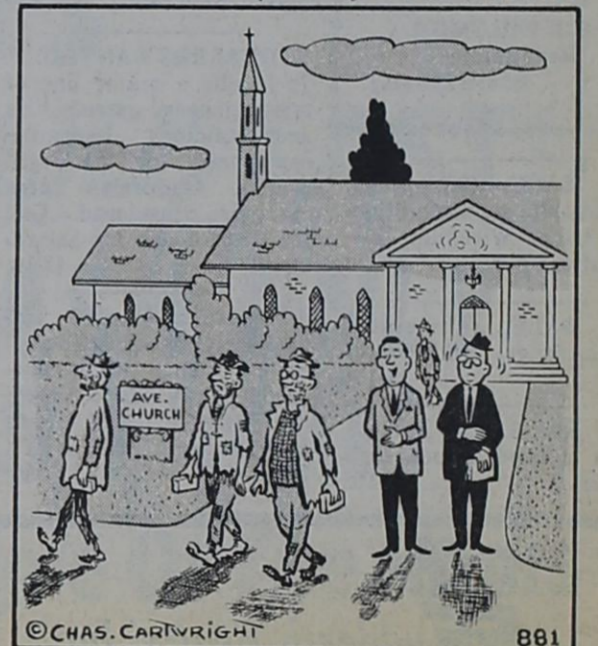
"The Finance Committee is trying a whole new approach with our pledge workers!"