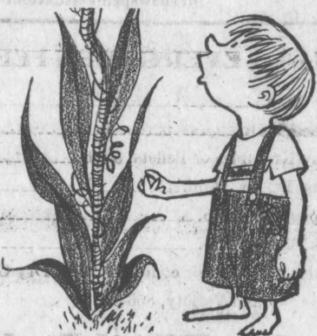
"Wow! These beans grow almost as fast as my savings account at..."

Any erroneous reflection upon the character, standing or reputation of any person, firm or corporation which may appear in the columns of The Informer will gladly be corrected upon its being brought to the attention of the publisher.