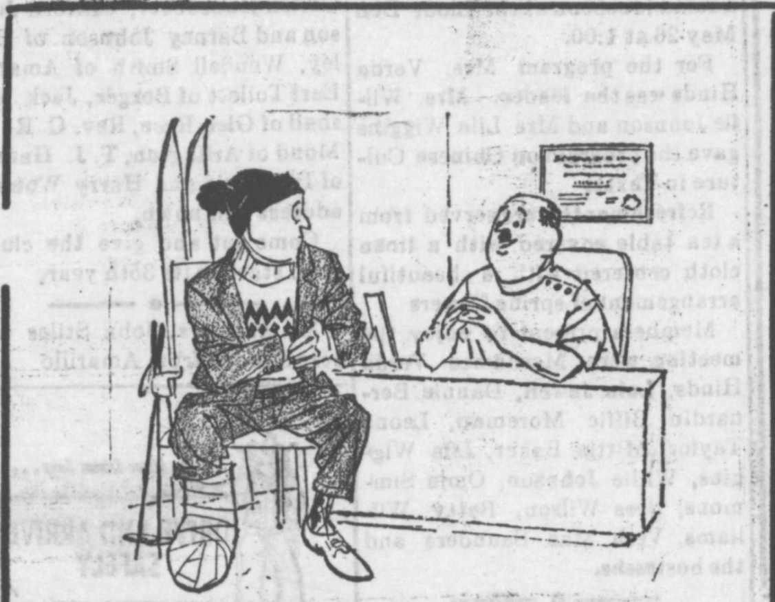
"Sure, I'll take a check from

NOTICE—Any erroneous reflection upon the character, standing or reputation of any person, firm or corporation which may appear in the columns of The Informer will gladly be corrected upon its being brought to the attention of the publisher.