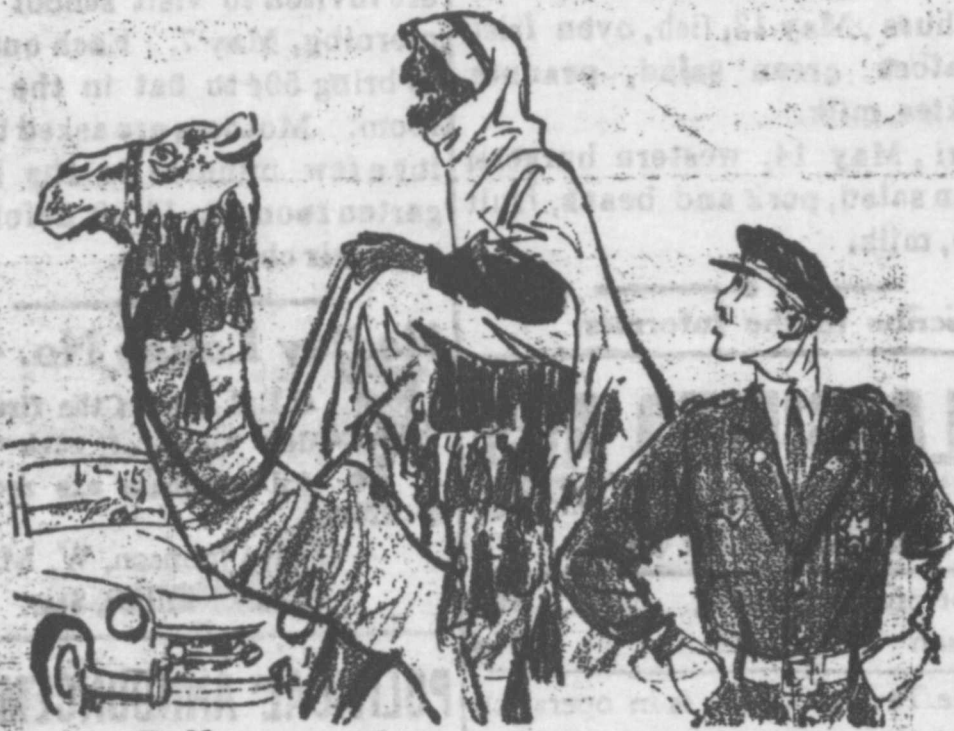
Folks come from all over to save at

NOTICE—Any erroneous reflection upon the character, standing or reputation of any person, firm or corporation which may appear in the columns of The Informer will gladly be corrected upon its being brought to the attention of the publisher.