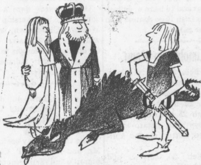
"Never mind your daughter's hand . . . just give me a check from"

NOTICE—Any erroneous reflection upon the character, standing or reputation of any person, firm or corporation which may appear in the columns of The Informer will gladly be corrected upon its being brought to the attention of the publisher.