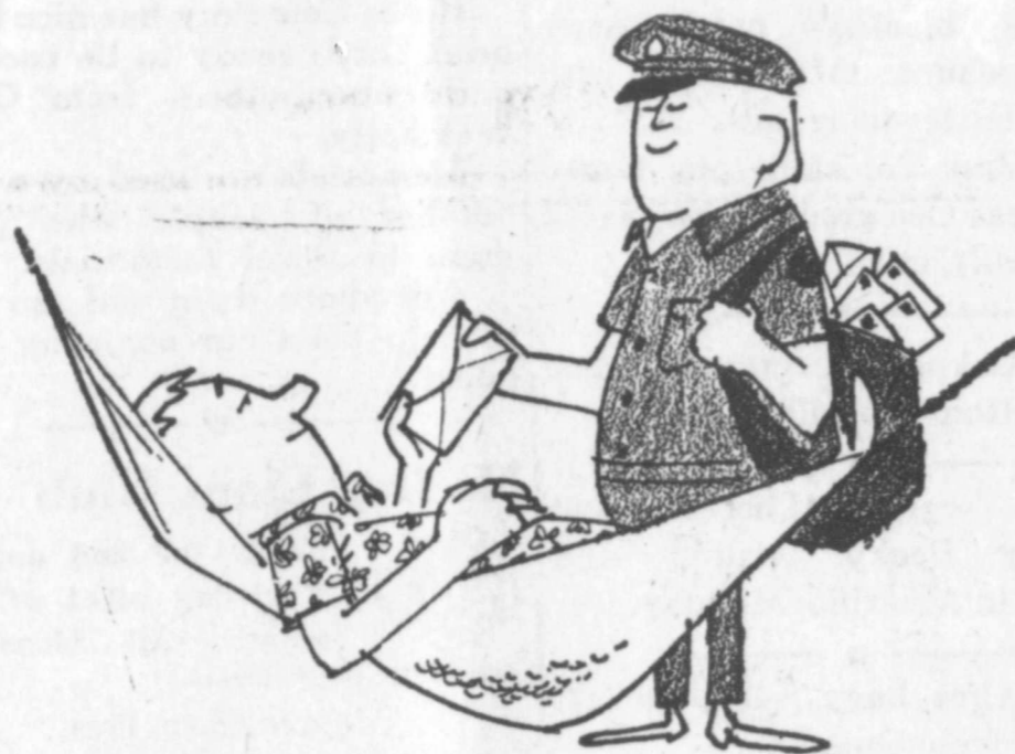
It's easy to save by mail and earn at

$2.00 per year in Donley County, $3.00 elsewhere Published every Friday at Hedley, Texas Entered as second class matter October 28, 1910, at the post office at Hedley, Texas, under the Act of March 3, 1879. In case of error in legal or other advertising the publisher does not hold himself liable for damages in excess of the amount received for such advertising. All obituaries, resolutions of respect, cards of thanks, advertising of church or society functions, when admission charged, will be treated as advertising and charged for accordingly. NOTICE—Any erroneous reflection upon the character, standing or reputation of any person, firm or corporation which may appear in the columns of The Informer will gladly be corrected upon its being brought to the attention of the publisher.