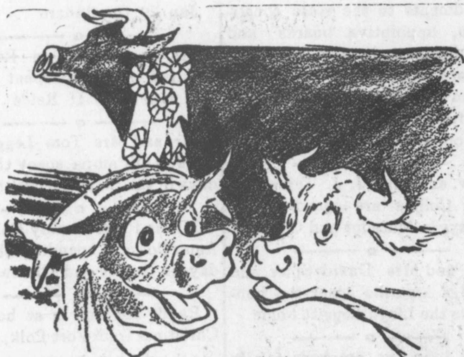
"His registry fills a whole deposit box at the

NOTICE—Any erroneous reflection upon the character, standing or reputation of any person, firm or corporation which may appear in the columns of The Informer will gladly be corrected upon its being brought to the attention of the publisher.