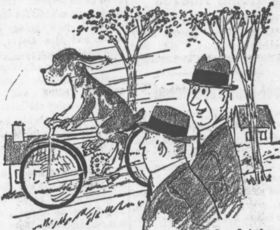
"Oh, he's not so smart. He could be driving his own car with a loan from

NOTICE—Any erroneous reflection upon the character, standing or reputation of any person, firm or corporation which may appear in the columns of The Informer will gladly be corrected upon its being brought to the attention of the publisher.