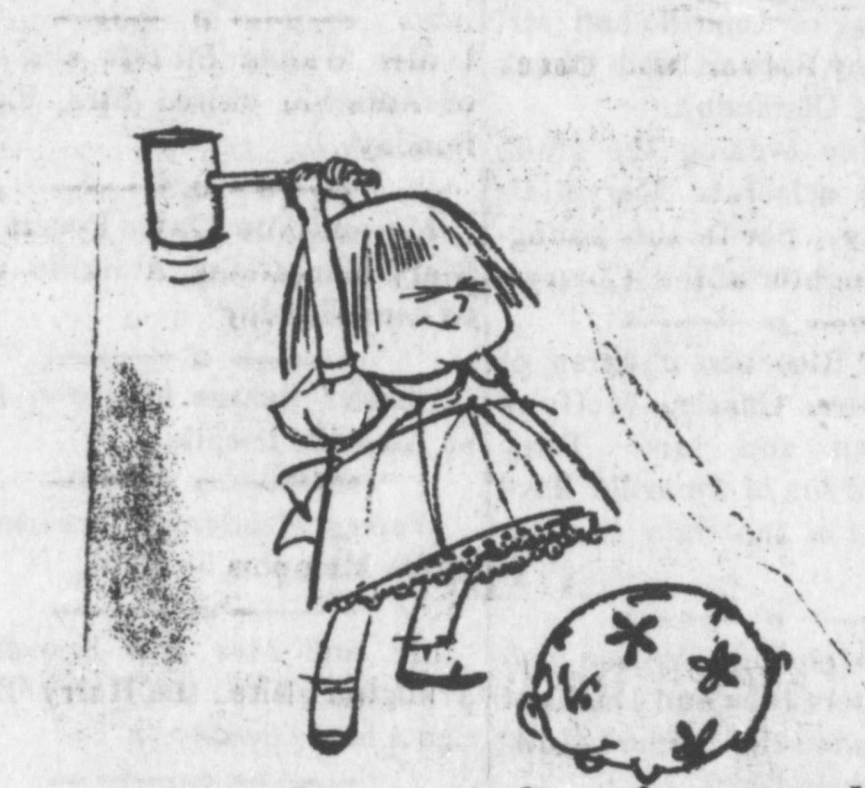
Need working capital?...for personal or business reasons? Come to the

NOTICE—Any erroneous reflection upon the character, standing or reputation of any person, firm or corporation which may appear in the columns of The Informer will gladly be corrected upon its being brought to the attention of the publisher.