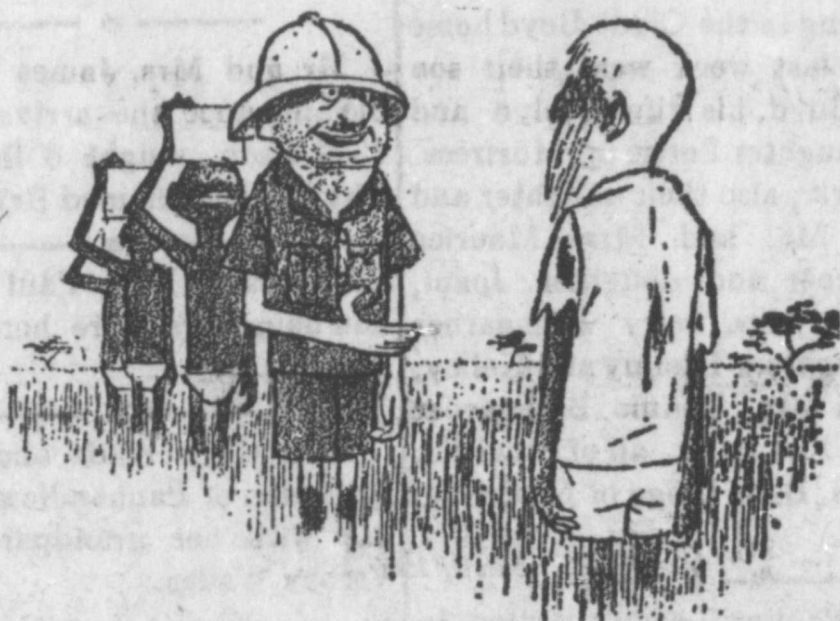
"Dr. Livingston, I presume you bank by mail at

NOTICE—Any erroneous reflection upon the character, standing or reputation of any person, firm or corporation which may appear in the columns of The Informer will gladly be corrected upon its being brought to the attention of the publisher.