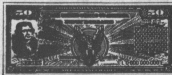
Bonds are safe. If lost, stolen, or destroyed, we replace them. When needed, they can be cashed at your bank. Tax may be deferred until redemption. And always remember, Bonds are a proud way to save.