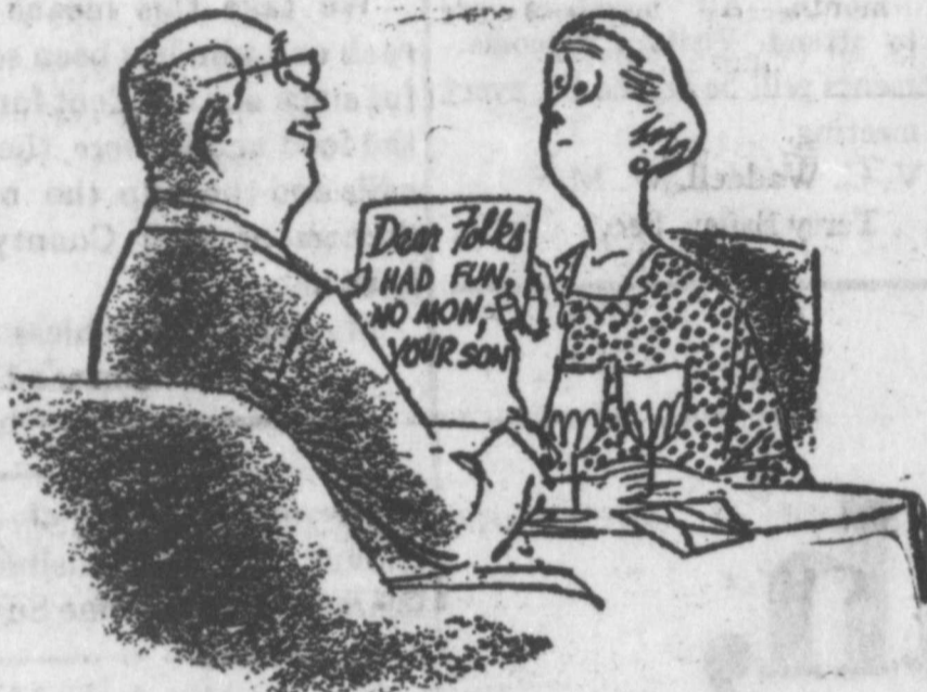
"Well, Junior is still hitting the books... my check book, that is."

NOTICE—Any erroneous reflection upon the character, standing or reputation of any person, firm or corporation which may appear in the columns of The Informer will gladly be corrected upon its being brought to the attention of the publisher.