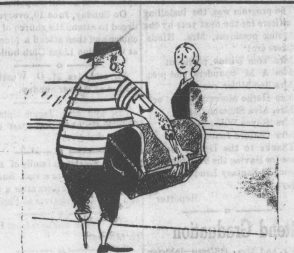
Folks come from all over to save at the

NOTICE—Any erroneous reflection upon the character, standing or reputation of any person, firm or corporation which may appear in the columns of The Informer will gladly be corrected upon its being brought to the attention of the publisher.