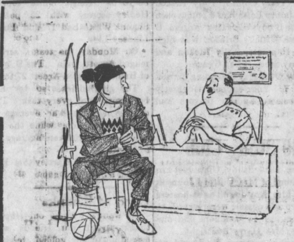
"Sure, I'll take a check from

be treated as advertising and charged for accordingly. NOTICE—Any erroneous reflection upon the character, standing or reputation of any person, firm or corporation which may appear in the columns of The Informer will gladly be corrected upon its being brought to the attention of the publisher.