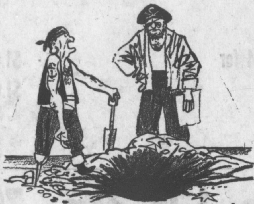
"I told ya' we should a' kept it in the"

Please do your part to help keep the cemetery looking nice