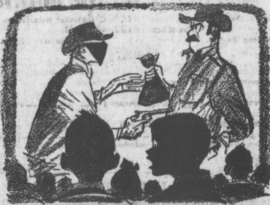
"I told ya he shoulda kept it in the"

NOTICE—Any erroneous reflection upon the character, standing or reputation of any person, firm or corporation which may appear in the columns of The Informer will gladly be corrected upon its being brought to the attention of the publisher.