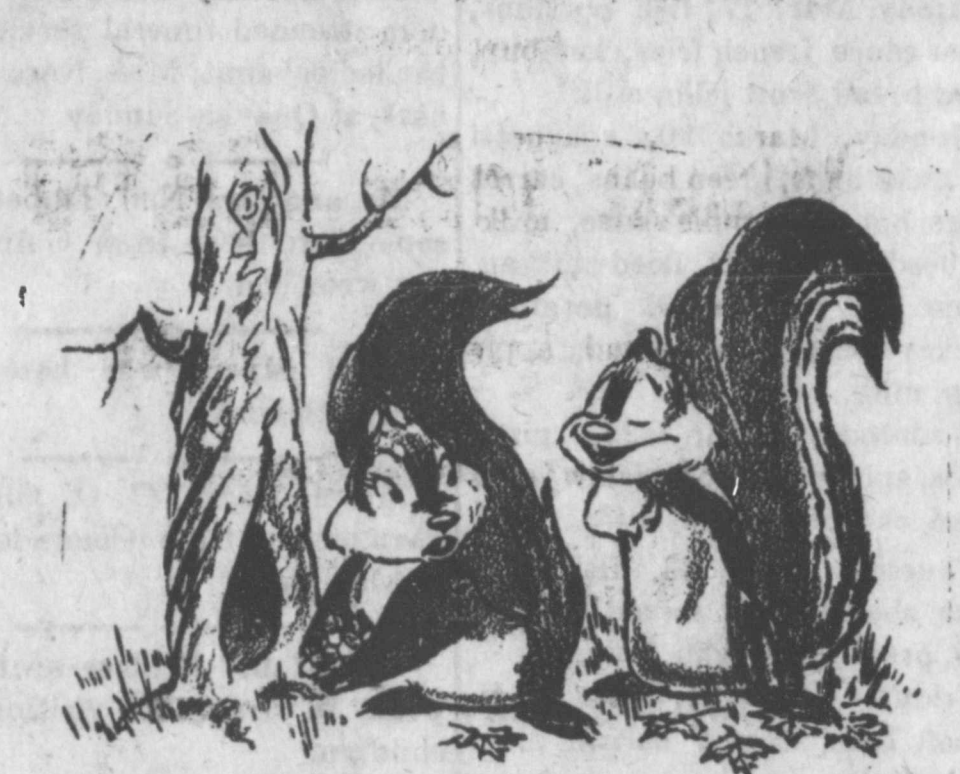
"Nuts! I store my valuables in a safe deposit box at the

NOTICE—Any erroneous reflection upon the character, standing or reputation of any person, firm or corporation which may appear in the columns of The Informer will gladly be corrected upon its being brought to the attention of the publisher.