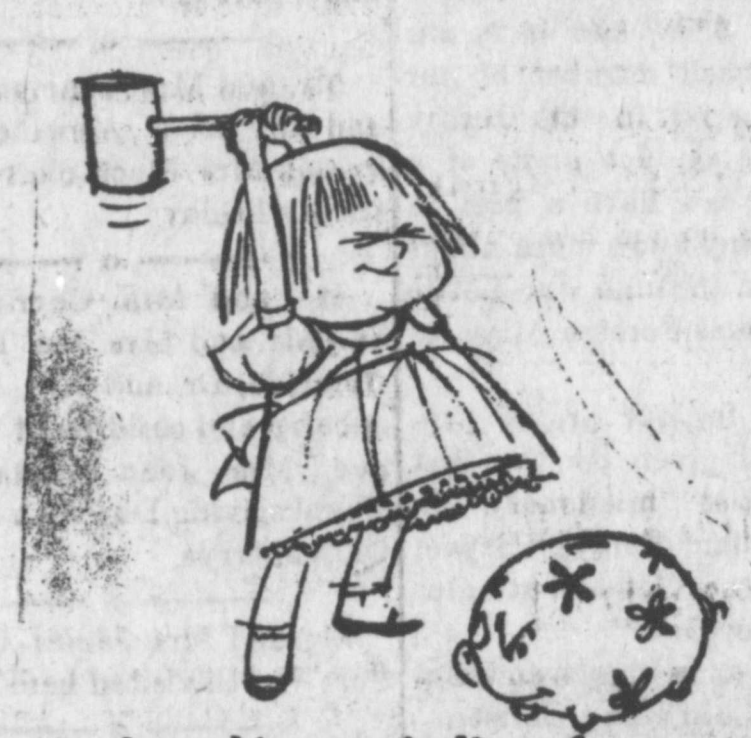
Need working capital? . . . for personal or business reasons? Come to the

NOTICE—Any erroneous reflection upon the character, standing or reputation of any person, firm or corporation which may appear in the columns of The Informer will gladly be corrected upon its being brought to the attention of the publisher.