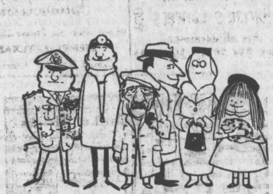
It takes all kinds - that's why we make all kinds of loans!

NOTICE—Any erroneous reflection upon the character, standing or reputation of any person, firm or corporation which may appear in the columns of The Informer will gladly be corrected upon its being brought to the attention of the publisher.