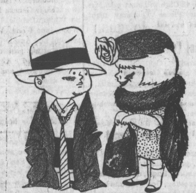
"... Now let's open a joint account at

NOTICE—Any erroneous reflection upon the character, standing or reputation of any person, firm or corporation which may appear in the columns of The Informer will gladly be corrected upon its being brought to the attention of the publisher.