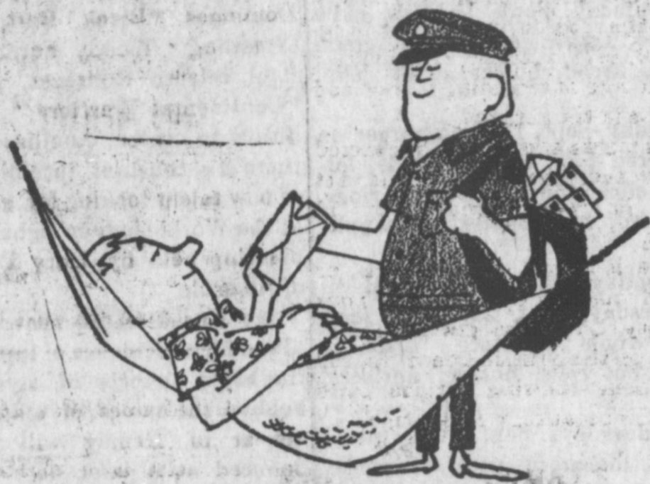
It's easy to save by mail and earn at

NOTICE —Any erroneous reflection upon the character, standing or reputation of any person, firm or corporation which may appear in the columns of The Informer will gladly be corrected upon its being brought to the attention of the publisher.