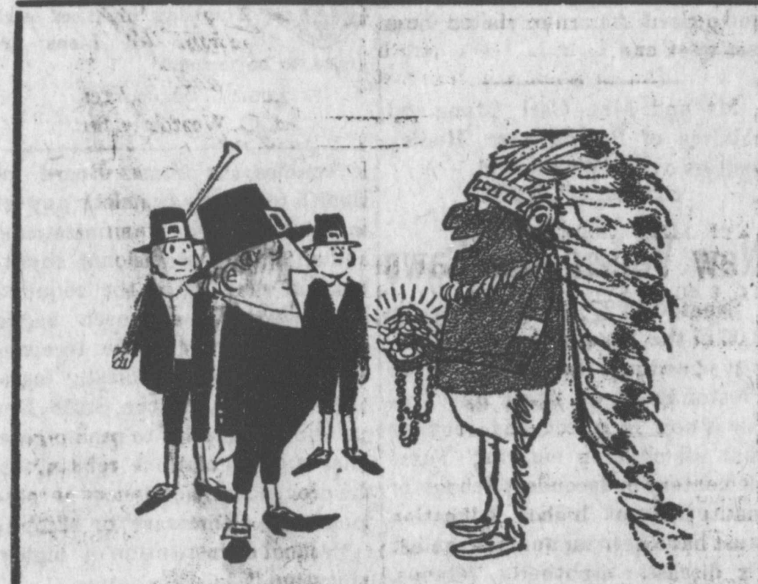
Now I can start-um regular savings at

NOTICE—Any erroneous reflection upon the character, stand ing or reputation of any person, firm or corporation which may appear in the columns of The Informer will gladly be corrected upon its being brought to the attention of the publisher.