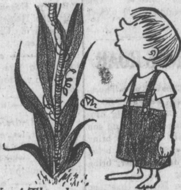
"Wow! These beans grow almost as fast as my savings account at..."

NOTICE—Any erroneous reflection upon the character, standing or reputation of any person, firm or corporation which may appear in the columns of The Informer will gladly be corrected upon its being brought to the attention of the publisher.