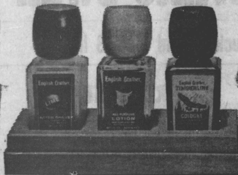
The Winner's Circle Gift Set in a handsome box. $4.00

They're all made by English Leather. The all-purpose lotion has the girl-getting fragrance that made English Leather famous in the first place. Use it as an after shave or after whatever. The English Leather Lime is just what it says—LIME—tangy and delicious...The Timberline cologne is different, new. More outdoors-y. Sportier. But it has the same "wow" effect on women. Three 2-ounce bottles.