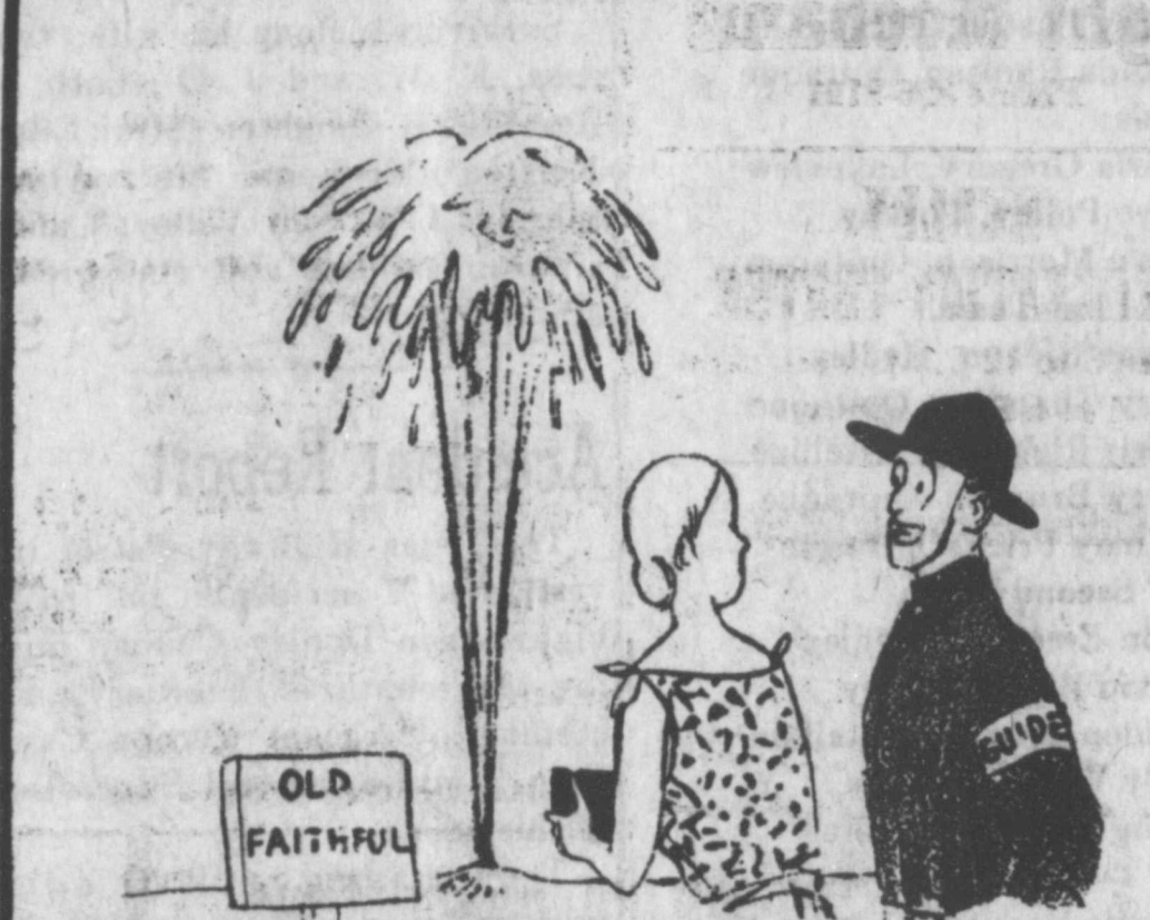
"As regular as earnings on your savings at

NOTICE—Any erroneous reflection upon the character, standing or reputation of any person, firm or corporation which may appear in the columns of The Informer will gladly be corrected upon its being brought to the attention of the publisher.