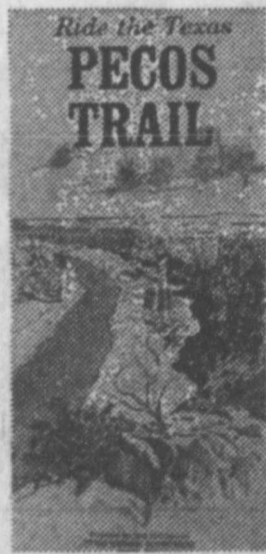
Send for the Pecos Trail folder and you'll know where to sand-surf.