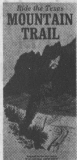
On the Mountain Trail you can see a county bigger than Connecticut.