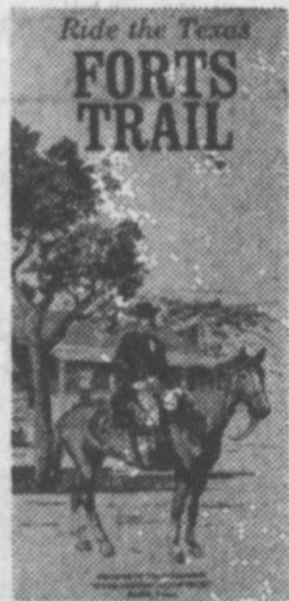
Follow the Forts Trail and you can dine at a restaurant that serves buffalo steaks.