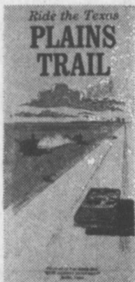
Take the Plains Trail and you'll see a canyon over 100 miles long.

Trail folders. These folders include detailed maps prepared by the Texas Highway Department and descriptive notes on things and places you never knew existed in Texas! land of contrast.