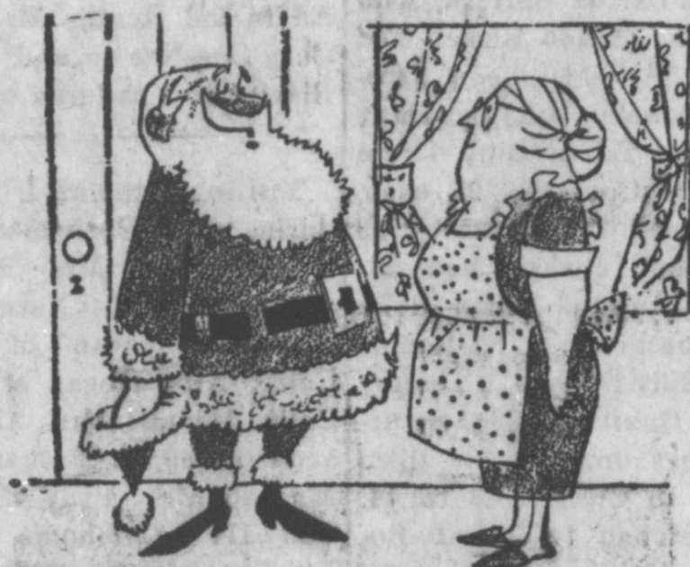
"The sled broke down again this year... it's a good thing I had those traveler's checks from

NOTICE—Any erroneous reflection upon the character, standing or reputation of any person, firm or corporation which may appear in the columns of The Informer will gladly be corrected upon its being brought to the attention of the publisher.