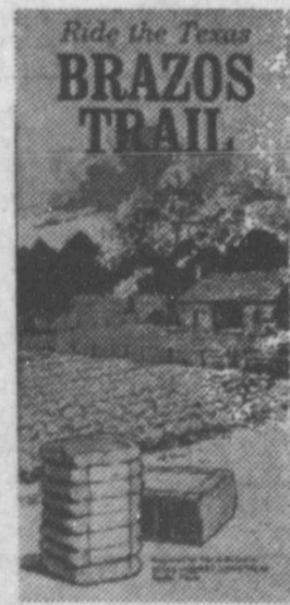
The Brazos Trail tells you where to take Sunday afternoon rides in a surrey.