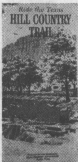
Take the Hill Country Trail and find out whose hair is mohair.