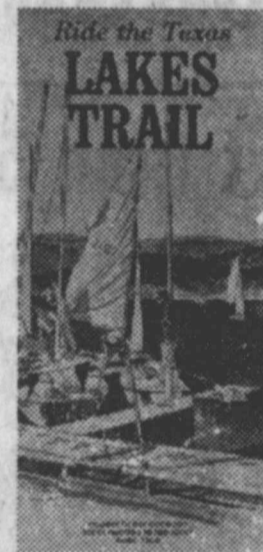
Follow the Lakes Trail and discover what "First Mondays" are and what you can swap there.