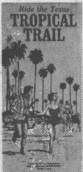
Take the Tropical Trail and maybe you'll catch a glimpse of the near-extinct whooping crane.