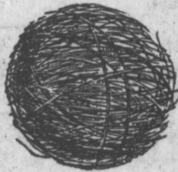
Some people save string

NOTICE—Any erroneous reflection upon the character, standing or reputation of any person, firm or corporation which may appear in the columns of The Informer will gladly be corrected upon its being brought to the attention of the publisher.