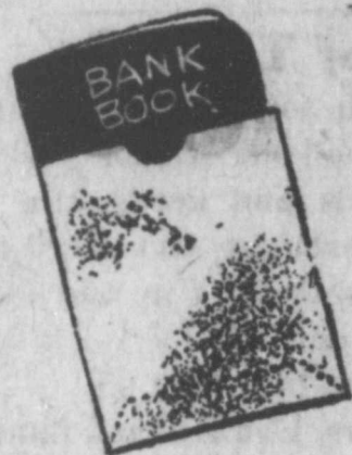
Others prefer money!