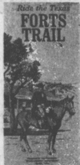
Follow the Forts Trail and you can dine at a restaurant that serves buffalo steaks.