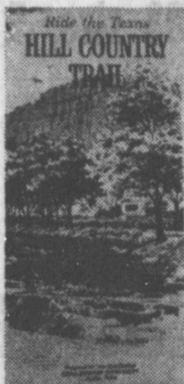
Take the Hill Country Trail and find out whose hair is mohair.