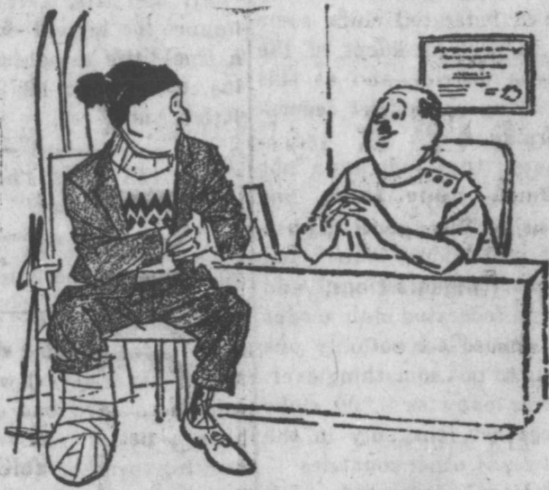
"Sure, I'll take a check from

NOTICE—Any erroneous reflection upon the character, standing or reputation of any person, firm or corporation which may appear in the columns of The Informer will gladly be corrected upon its being brought to the attention of the publisher.