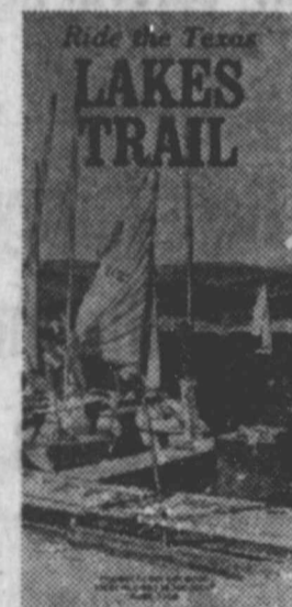
Follow the Lakes Trail and discover what "First Mondays" are and what you can swap there.