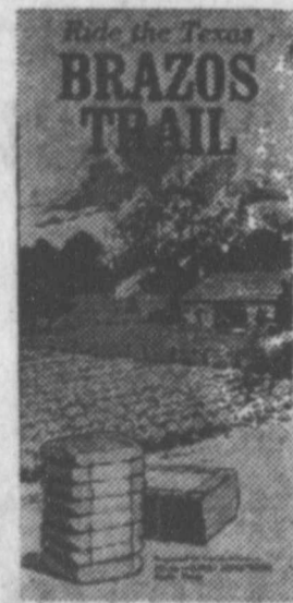
The Brazos Trail tells you where to take Sunday afternoon rides in a surrey.