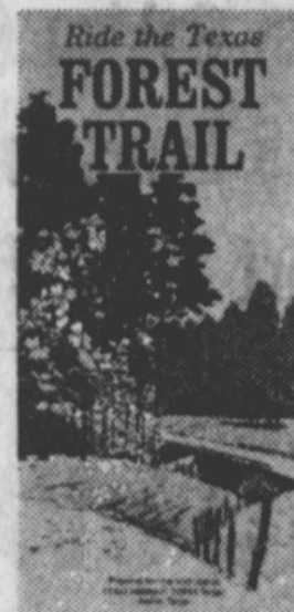
On the Forest Trail you can take the shortest railroad ride in the country.