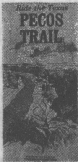
Send for the Pecos Trail folder and you'll know where to sand-surf.