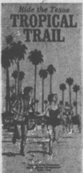
Take the Tropical Trail and maybe you'll catch a glimpse of the near-extinct whooping crane.