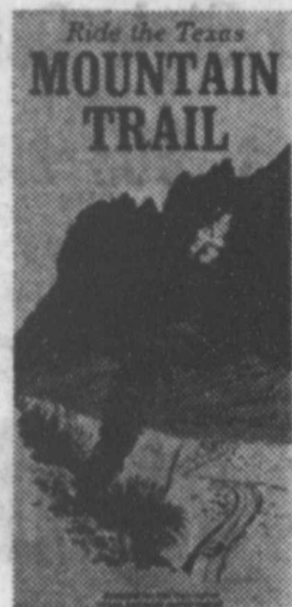
On the Mountain Trail you can see a county bigger than Connecticut.