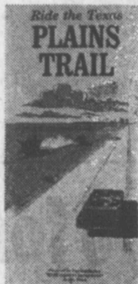
Take the Plains Trail and you'll see a canyon over 100 miles long.

Trail folders. These folders include detailed maps prepared by the Texas Highway Department and descriptive notes on things and places you never knew existed in Texas! land of contrast.