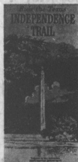
On the Independence Trail you'll see the only oceanarium between the Pacific and the Atlantic.