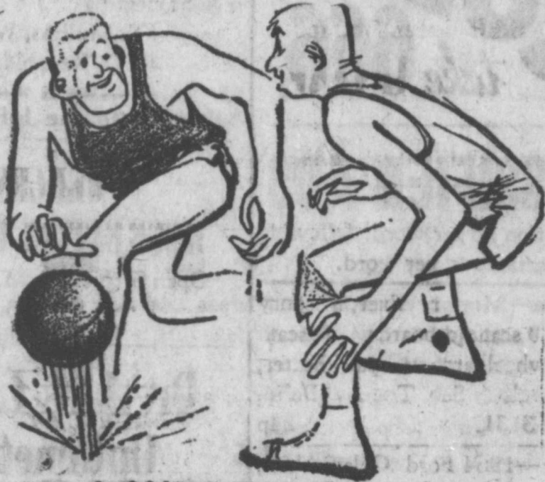
"I'm dribbling away less cash now with a checking account at the

All obituaries, resolutions of respect, cards of thanks, advertising of church or society functions, when admission charged, will be treated as advertising and charged for accordingly.