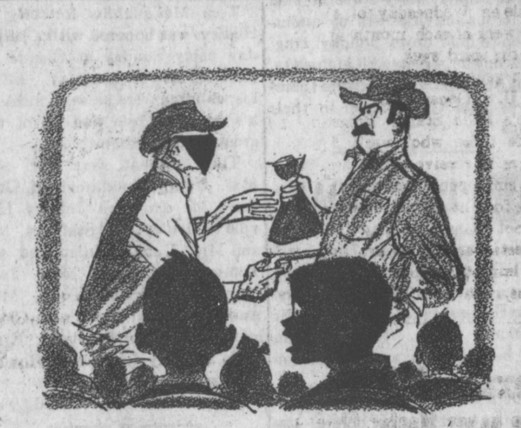
"I told ya he shoulda kept it in the

NOTICE—Any erroneous reflection upon the character, standing or reputation of any person, firm or corporation which may appear in the columns of The Informer will gladly be corrected upon its being brought to the attention of the publisher.