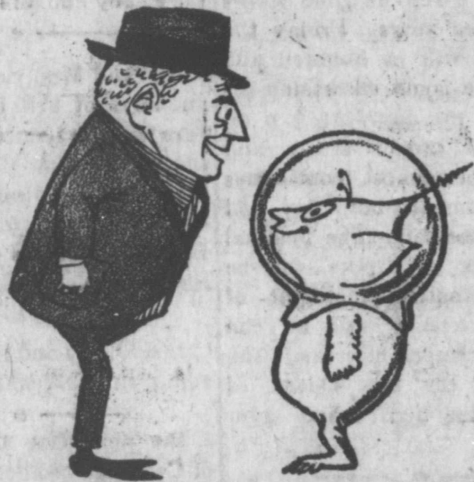
"Let me take you to our leading lender!"

NOTICE—Any erroneous reflection upon the character, standing or reputation of any person, firm or corporation which may appear in the columns of The Informer will gladly be corrected upon its being brought to the attention of the publisher.