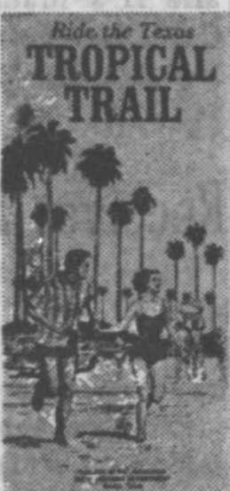
Take the Tropical Trail and maybe you'll catch a glimpse of the near-extinct whooping crane.