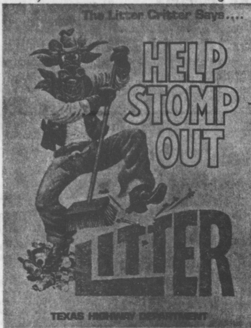
BITTER CRITTER — The Litter Critter, the Texas Highway Department's faithful sidekick in the battle against highway litter, now is making his appearance on colorful 17x22-inch posters. Litter pickup costs the Department $2 million a year. Schools, garden clubs and other organizations concerned about litter may obtain the posters from Highway Department District Offices, Tourist Information Bureaus or the Travel and Information Division, Texas Highway Department, Austin (78703).