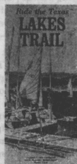
Follow the Lakes Trail and discover what "First Mondays" are and what you can swap there.