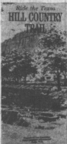
Take the Hill Country Trail and find out whose hair is mohair.