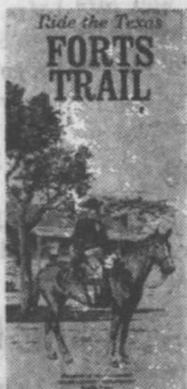
Follow the Forts Trail and you can dine at a restaurant that serves buffalo steaks.