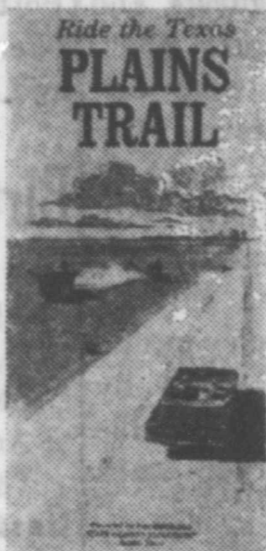
Take the Plains Trail and you'll see a canyon over 100 miles long.

Trail folders. These folders include detailed maps prepared by the Texas Highway Department and descriptive notes on things and places you never knew existed in Texas! land of contrast.