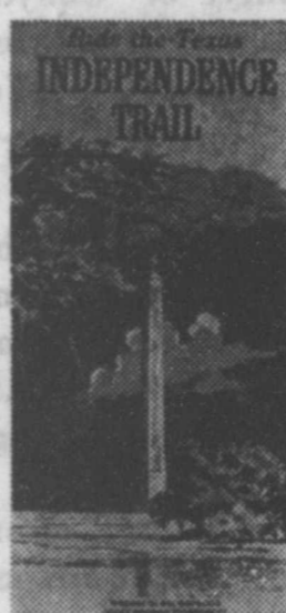
On the Independence Trail you'll see the only oceanarium between the Pacific and the Atlantic.