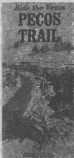
Send for the Pecos Trail folder and you'll know where to sand-surf.