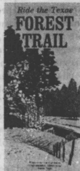
On the Forest Trail you can take the shortest railroad ride in the country.