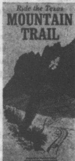
On the Mountain Trail you can see a county bigger than Connecticut.