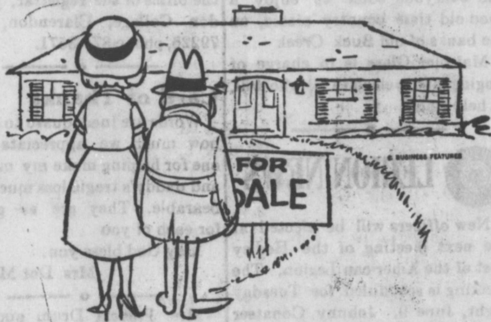
Short story: We loan—you own!

NOTICE—Any erroneous reflection upon the character, standing or reputation of any person, firm or corporation which may appear in the columns of The Informer will gladly be corrected upon its being brought to the attention of the publisher.