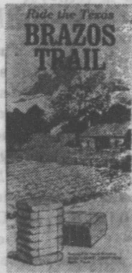
The Brazos Trail tells you where to take Sunday afternoon rides in a surrey.